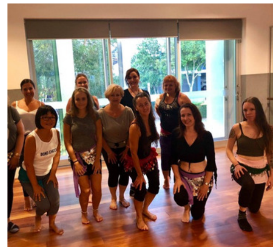
Our beginners class at Robina.